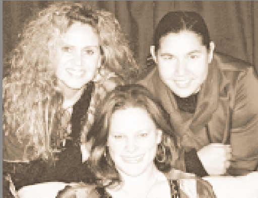
Yowarliny Singers 2004.