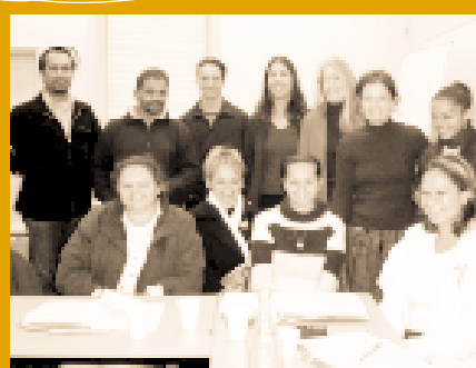
Attendees of Artsource Professional Development Workshop held Albany, July 2003.